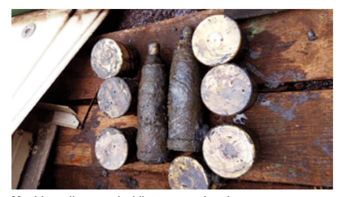
Munitions discovered whilst treasure hunting

CHIRP contacted the Royal Navy bomb disposal unit and their advice is quite clear. Under NO circumstances are any munitions to be handled. Wherever you are in the world, if suspicious materials are discovered then immediately contact the local authorities in order for their experts to assess and deal with the hazard.