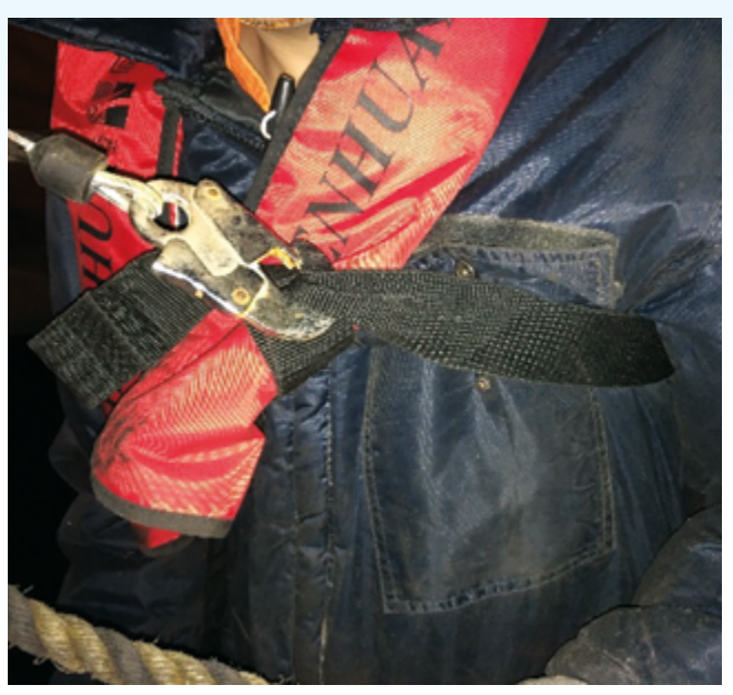
Lifejacket with safety lanyard.

OUTLINE: A report outlining dangers with inertia-wire rope safety lanyards when not used correctly.