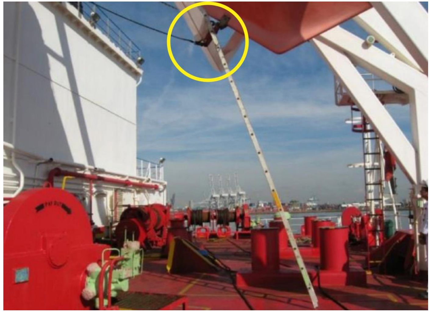
Free-fall lifeboat and forward hook (marked with a yellow circle) with ladder as positioned by the AB