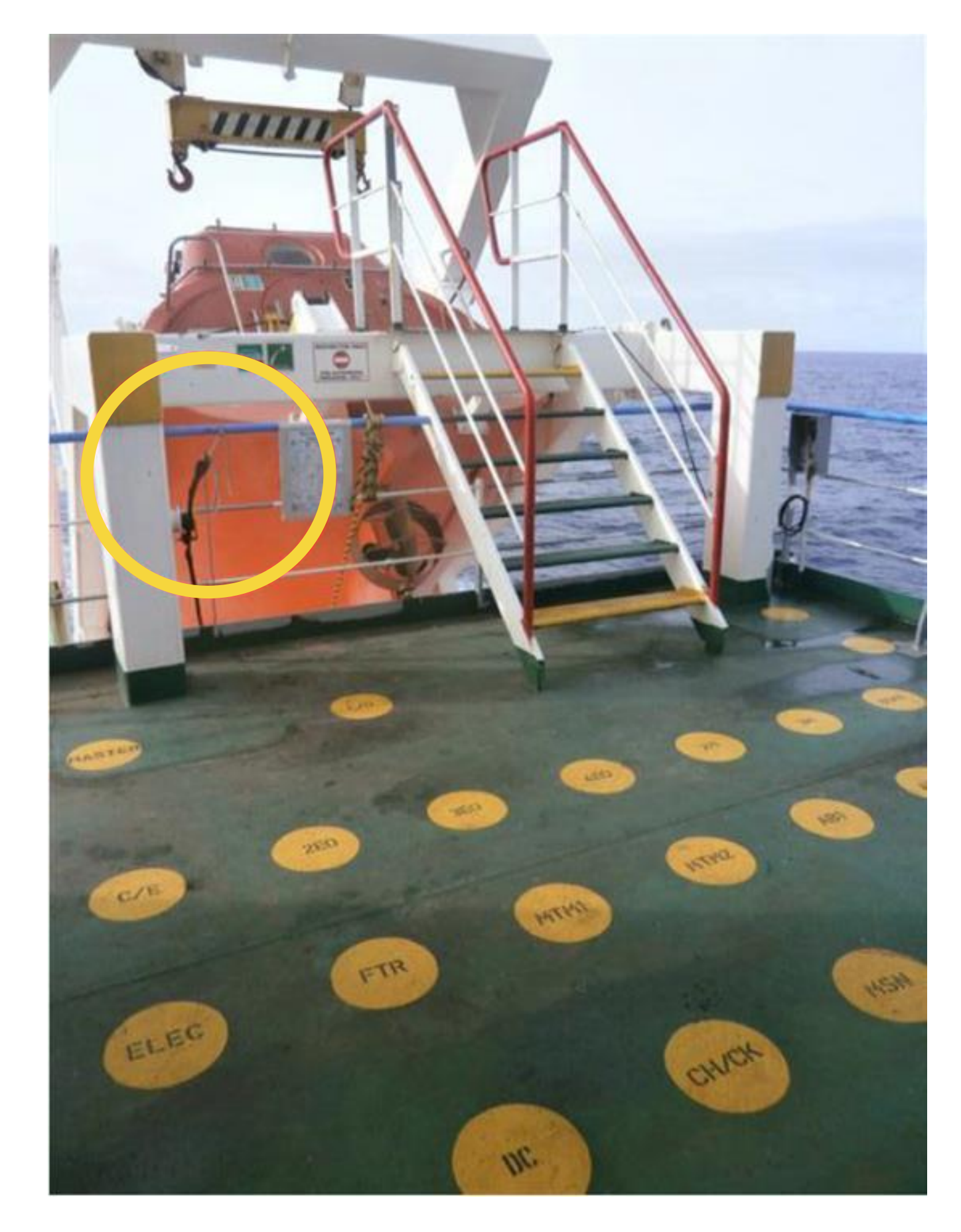
Working area for the original maintenance task (turnbuckle marked with a yellow circle).