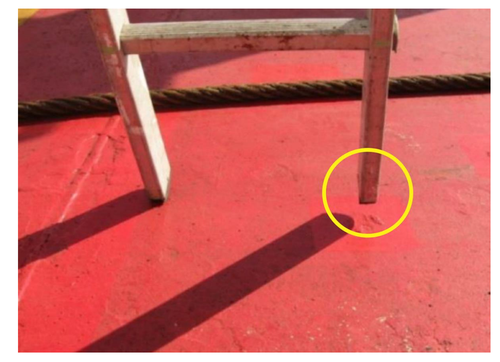
The feet of the ladder in the accident location