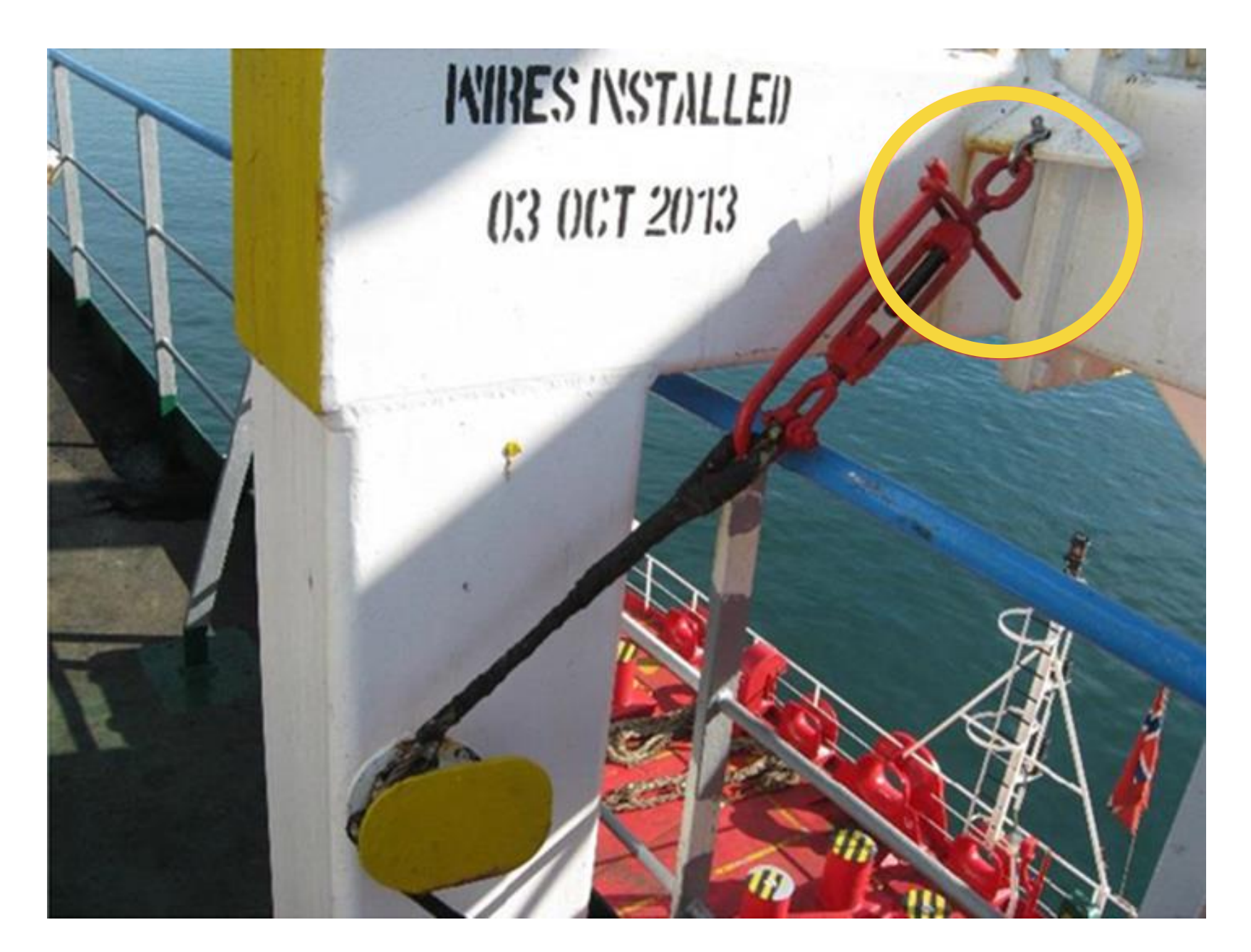
Turnbuckle and the pin (marked with yellow circle) after the maintenance job completed.