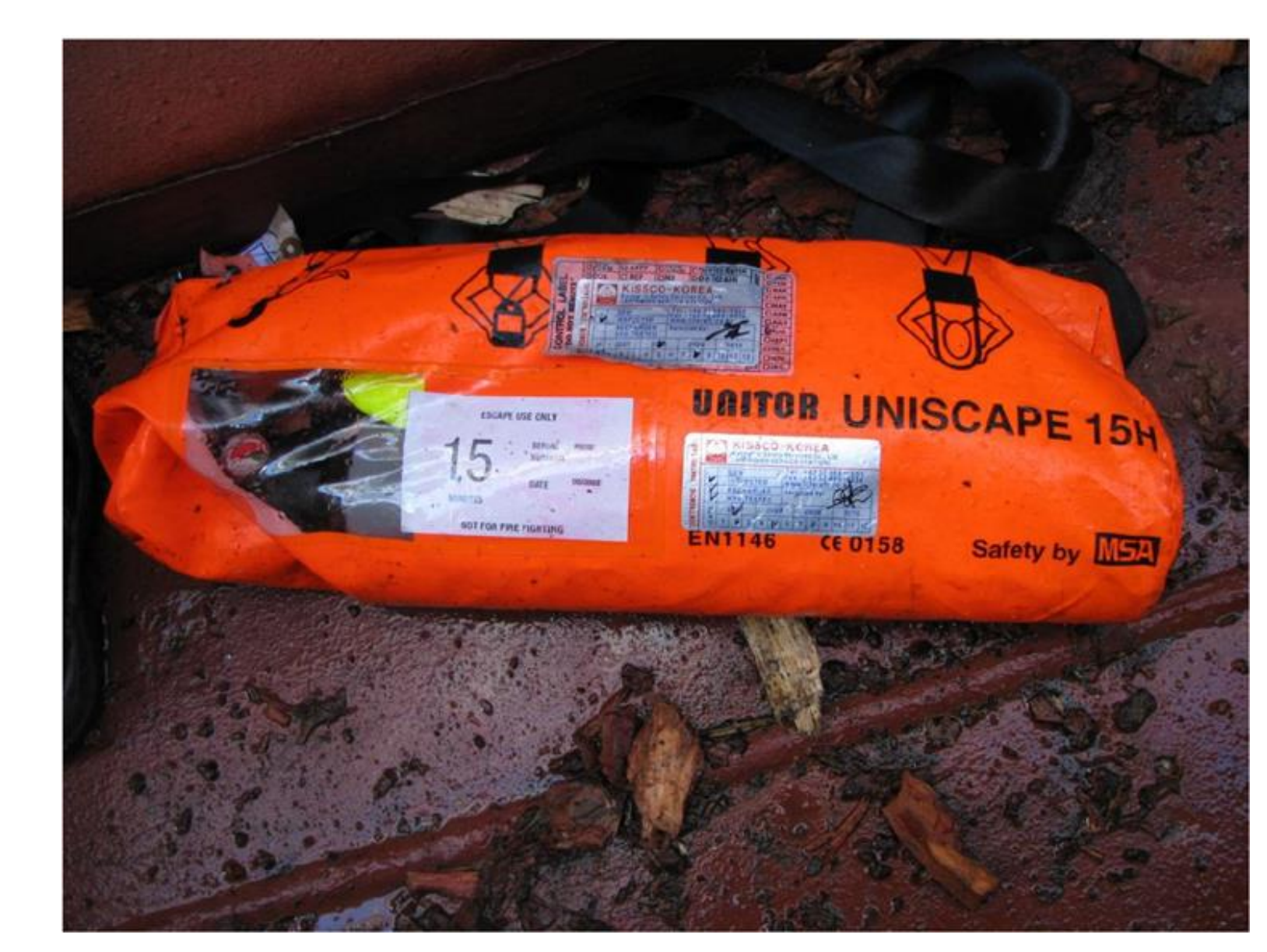
EEBD used during the rescue