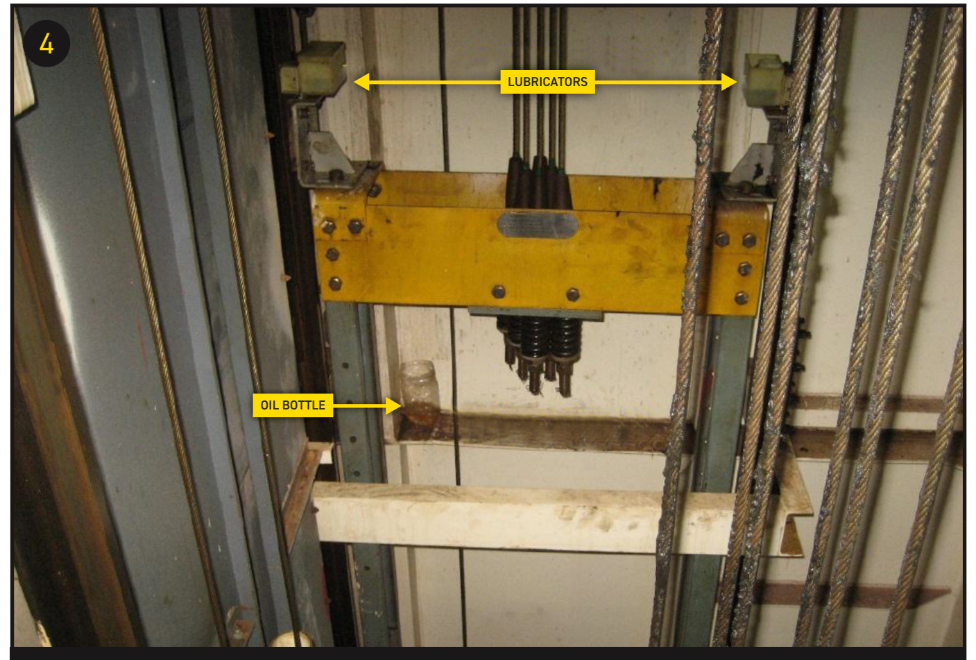
FIGURE 4 POSITION OF LUBRICATORS AND PLASTIC OIL BOTTLE LEFT IN THE ELEVATOR SHAFT

Due to a miscommunication regarding the correct email address, there was no immediate response from the local authorities. At about 2222 local time, the master received instructions from the agent to heave anchor and meet with a rescue vessel from which five people embarked to conduct a medical examination of the deceased. The body was later taken ashore by boat and a post mortem confirmed the cause of death to be a blunt compressive trauma to the trunk. The company arranged for an authorised expert to carry out an inspection of the elevator. The inspection did not indicate any failure of the elevator's machinery in relation to this particular incident.