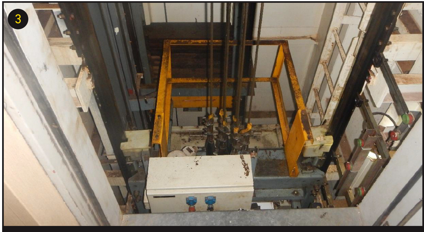
FIGURE 3 TOP OF ELEVATOR CAR SHOWING MAINTENANCE BOX AND SAFETY CAGE

The C/E notified the master immediately, who raised the general alarm and then went to the bridge to inform the company. He also radioed the local authorities for medical assistance. A member of the onboard medical emergency team entered the elevator shaft and confirmed that the electrician was not breathing and he could not detect a pulse. Hoisting arrangements, using wires and chain blocks, were rigged, which allowed the elevator car to be hoisted and the counterweight to move down and free the electrician. At 1815 local time the electrician was pulled out from the elevator shaft and the 2<sup>nd</sup> Officer, who was the ship's medical officer, confirmed that the electrician had no pulse.