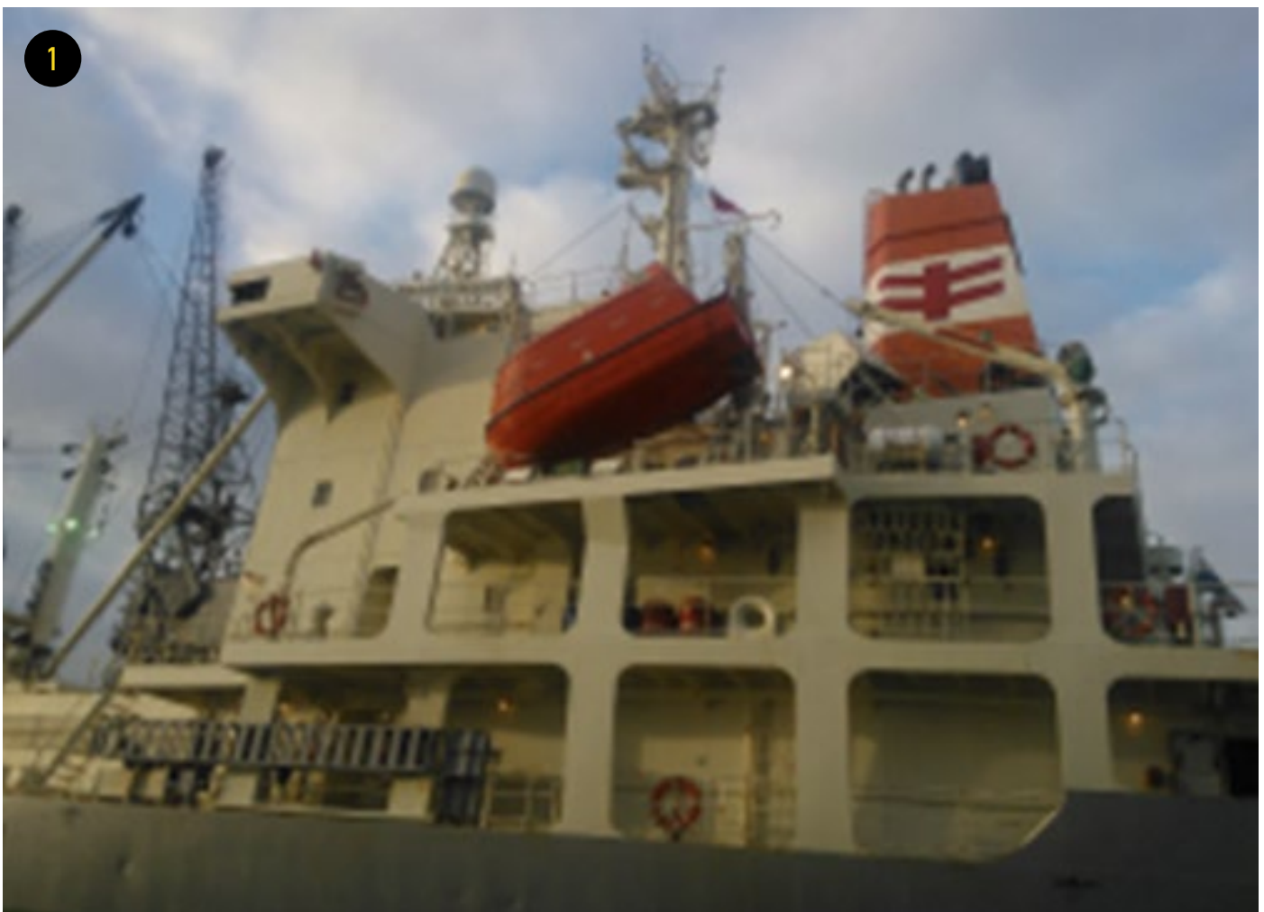
FIGURE 1 PORT SIDE LIFEBOAT AFTER THE INCIDENT

A REFRIGERATED CARGO SHIP HAD BERTHED IN SOUTHAMPTON TO DISCHARGE A CARGO OF FRUIT. ON THE DAY OF ARRIVAL THE LOCAL PORT STATE AUTHORITIES HAD BOARDED THE SHIP IN ORDER TO CONDUCT A PORT STATE CONTROL (PSC) INSPECTION, WHICH INCLUDED A LIFEBOAT DRILL. WHILE SECURING THE LIFEBOAT AFTER THE DRILL, THE SHIP'S BOSUN SUSTAINED MINOR INJURIES AS THE FORWARD END OF THE LIFEBOAT FELL FROM ITS DAVIT DUE TO IT NOT BEING CORRECTLY RESET WHEN IT WAS HOISTED FROM THE WATER ( FIGURE 1 ).