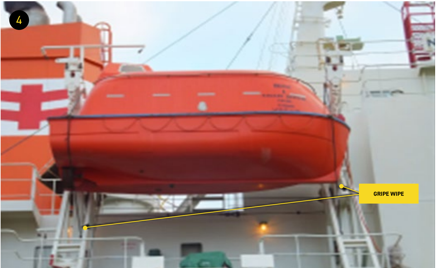
FIGURE 4 GRIPE WIRES (ON STARBOARD LIFEBOAT)