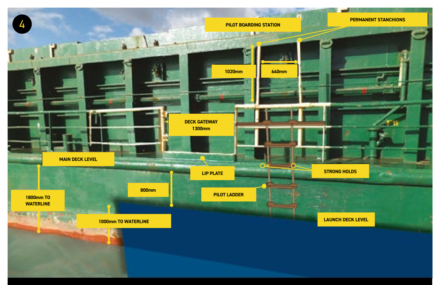
FIGURE 4 REPRODUCED IMAGE OF CARGO VESSEL'S DECK GATE AND PILOT BOARDING ARRANGEMENTS SOURCE MARINE ACCIDENT INVESTIGATION BRANCH – GOV.UK: ANNUAL REPORT 21/2017

Soon after a shore medical response team boarded the vessel. It was believed that the sea pilot's popliteal artery in his left leg had ruptured during the impact, causing massive blood loss. During attempts to stabilise the sea pilot's condition for evacuation, he suddenly went into cardiac arrest. Although cardio-pulmonary resuscitation (CPR) was given, the sea pilot succumbed to his injuries.