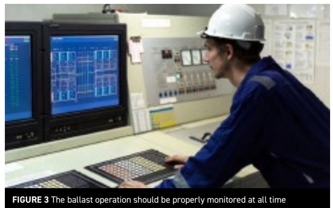
FIGURE 3 The ballast operation should be properly monitored at all time

Therefore, familiarisation with the ballast system and monitoring the operation by applying good ballast management practice remains vital. Similarly, ensuring accurate ballast tank management, including regular inspection and maintenance, is also important.