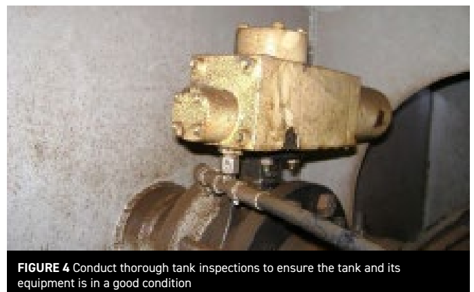
FIGURE 4 Conduct thorough tank inspections to ensure the tank and its equipment is in a good condition