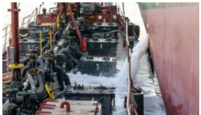
FIGURE 2 Beware what is alongside before de-ballasting